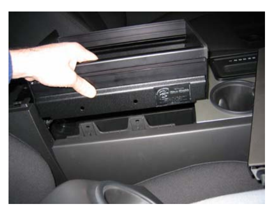
Position console so holes in side of console align w/ holes in factory console